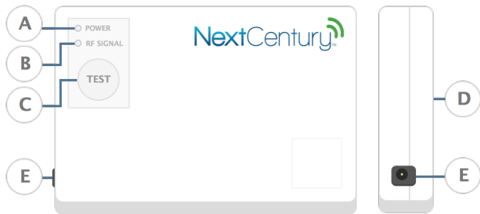
Figure 1 RE-201 Hardware

A Power Indicator B RF Signal Indicator C Test Button D Mounting Plate E 12 Volt Power